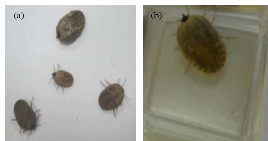
Fig. 1: Adult immersion test of camels ticks: a) Before immersion; b) After immersion

Collection of hard ticks: Engorged female ticks were manually collected from heavily infested camels admitted to the Veterinary Teaching Hospital of the college of Agriculture and Veterinary Medicine, Qassim University.