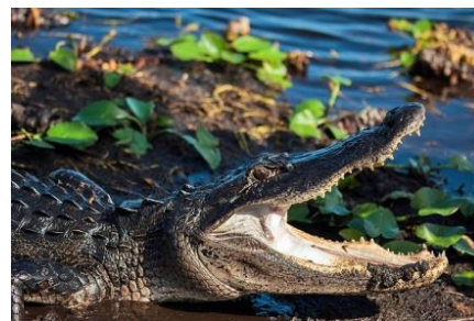
Everglades National Park