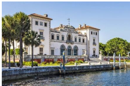
Vizcaya Museum & Gardens