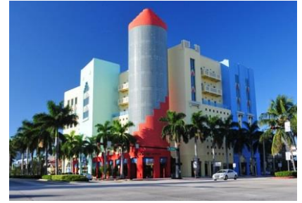
Art Deco Historic District