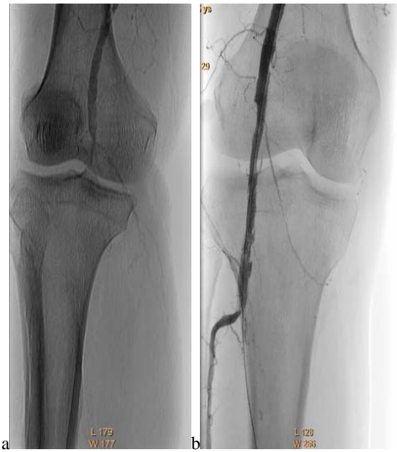
Fig. (2): Total Occlusion of P2 segment with poor runoff, A. After successful PTA ,B.