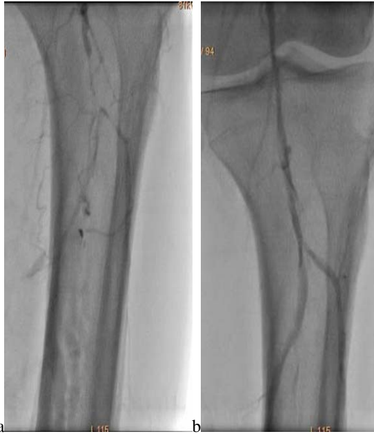
Fig. (5): Total Occlusion of P3 segment, A. Successful PTA with revascularization of PA to both anterior and posterior tibial arteries, B.