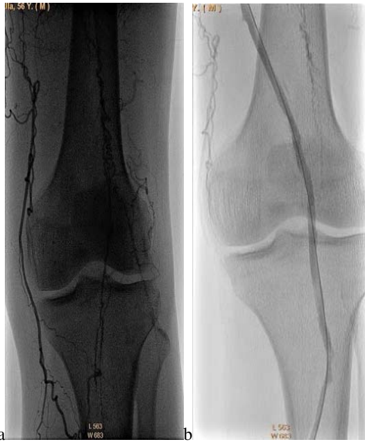
Fig. (1): Total Occlusion of the femoropopliteal artery transition with poor runoff, A. After successful PTA, B.