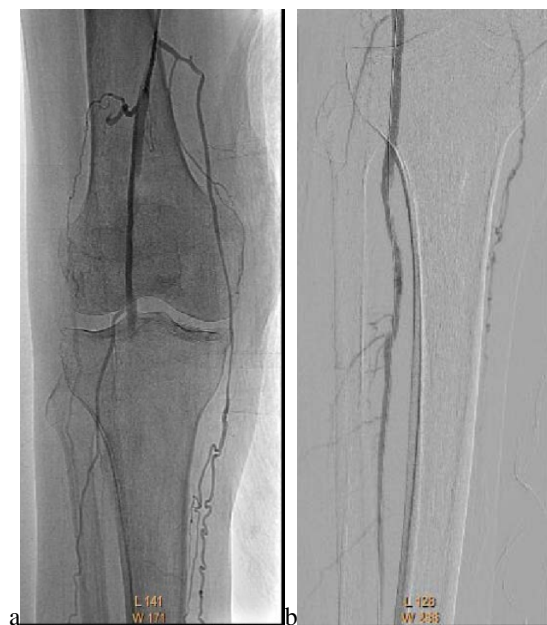
Fig. (4): Total Occlusion of P2 segment with very poor runoff, A. Successful PTA of the PA & the peroneal artery, B