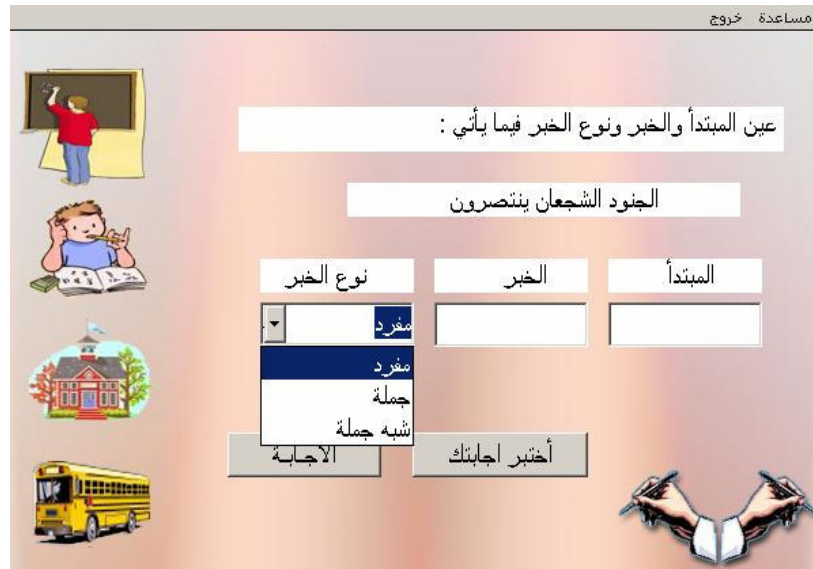
Fig. 3 A test item

The item bank is a database of test items. This component is used to generate different types of test items each time the learner is allowed to take the test. The test generator selects the test items in a random order. According to the selection criterion made by the instructor, all the test items that match this criterion are collected. Then, we apply a random function to present the selected test items to the learner.