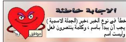
Fig. 5 A feedback message indicating incorrect answer

The feedback system compares the learner's answer produced from the sentence analysis subsystems with the correct answer that was generated by the system. If there is a match, a positive message will be sent to learner. Otherwise, an adequate feedback message will be sent to the learner, see Fig. 5.