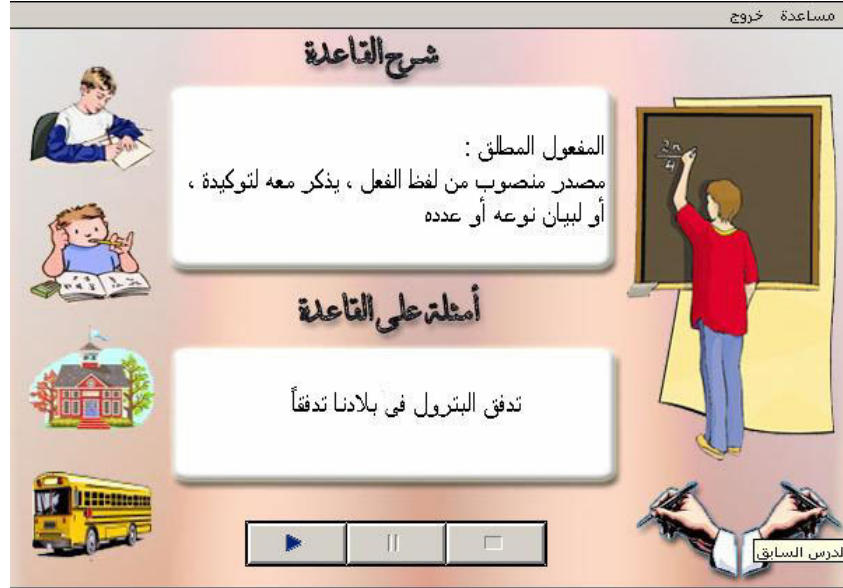
Fig. 2 A lesson