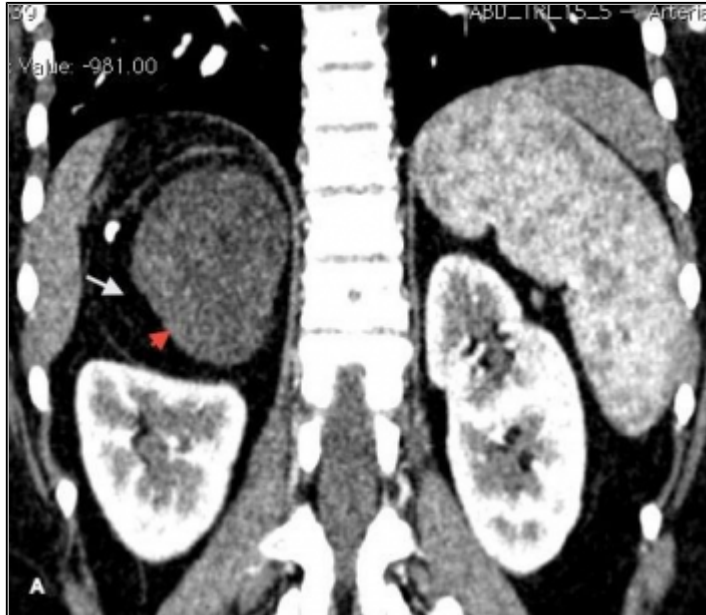
Figure 1 Abdominal CT with IV contrast reconstructed in coronal & sagittal planes.

There is a large right side retroperitoneal mass. The mass appears heterogeneous with mixed soft tissue (arrow head) and fat content (arrow). Tiny calcific foci are seen at the wall of the lesion.