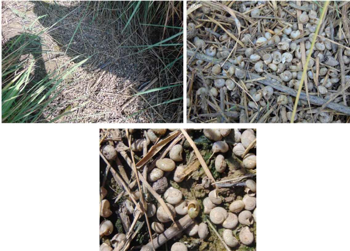
Fig. 3(a-c): Monacha obstructa on Egyptian clover, the locality is Forkous village Tamiya District (29°26.49'N 30°58.53'E), (a) Empty shells of snails in summer months where all the snails are dead in big number during mid-October, 2016 and (b, c) Closer picture of Monacha obstructa empty shells hidden under the grass and field wild weeds

become more active and increased in number in winter, starting from November, till April, especially on field wild weeds such as Chicory Cichorium pumilum Jacq. and annual Sowthistle Sonchus oleraceus L. Asteraceae where high humidity and more shade.