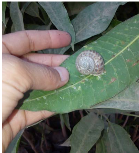
Fig. 5: Massylaea vermiculata was recorded on the mango trees leaves found on January, 2019 for only one time in Feedimeen village, Sannoris District

high temperature degree and low humidity, the snails were found in soil cracks or closer to the water canals and then inter an aestivation period.