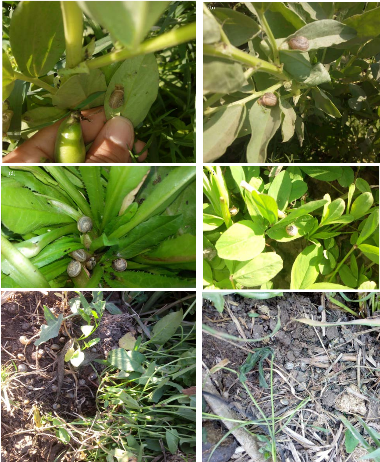
Fig. 4(a-f): (a) Individuals of Monacha obstructa that found on vegetation, (b) On Broad Bean Vicia faba L. Fabaceae, (c) Monacha obstructa found inside the leaves where more shade and humidity of chicory Cichorium pumilum Jacq. Asteraceae, (d) On Egyptian clover Trifolium alexandrinum L. Fabaceae, (e) Accumulations of Monacha obstructa in the soil ground close to Egyptian clover and (f) Accumulations of Monacha obstructa beside the field wild weeds under shade spots