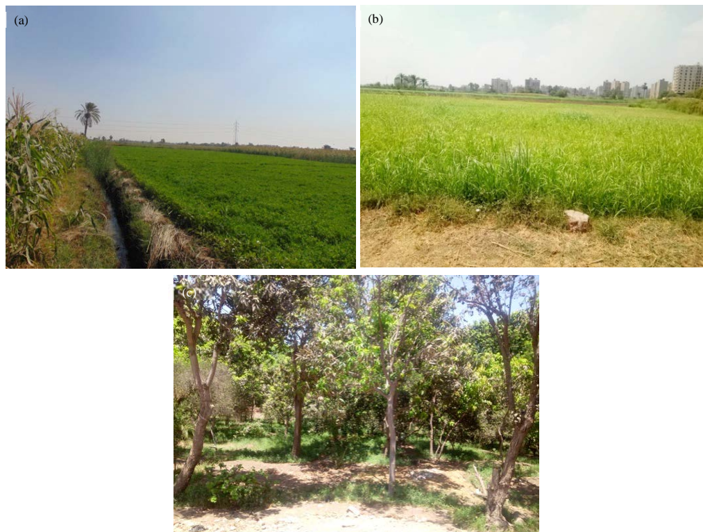
Fig. 2(a-c): Surveyed habitat locations of Monacha obstructa that had been recorded, (a) Forkous village (site: 1) the area is covered with Egyptian clover, (b) Dar Ramad site (site: 2) the area covered with Egyptian clover and (c) Feedimeen village (site: 3) the area is covered with Egyptian clover and with some Fruit trees