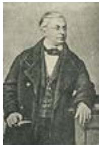
Fig. 4. Professor von Siebold.

A short time later, on 28th August 1851, Bilharz wrote to Siebold again (Figure 4): “I have not yet reported to you on the new phases that my portal-artery worm has entered. It has not turned into ... an ‘old wives’ tale, rather something that I would call even more amazing: a trematode with separate sexes. The worm I described in my last letter was the male. Upon more careful examination ..... of the intestinal veins, I soon found examples of the worm containing a gray thread in the caudal furrow .... The female could easily be pulled out of the furrow of the male and clearly recognized in its inner structure”. Shortly, von Siebold summarized these observations of Bilharz into a report that was published in the Zeitschrift für Wissenschaftliche Zoologie in 1852 [11] . By 1853, Bilharz was able to identify the worms, which he named Distomum haematobium and their eggs in the bladder and the liver of a dead Egyptian soldier and to describe the disease, which remains his enduring scientific legacy [3,12] .