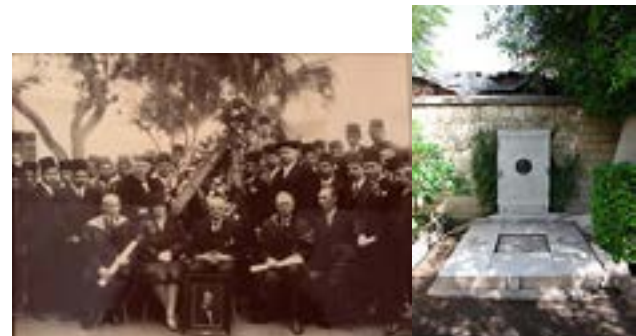
Figs. 7 and 8. The funeral of Theodor Bilharz, and his tomb in Cairo.

The memory of Theodor Bilharz is honored by Egyptian scientists. The Department of Medical Parasitology, Kasr Al Ainy exhibits a statue of Bilharz (unknown artist) (Figure 9). Bilharz Research Institute in Cairo was established and named to honor him (Figure 10). Upon the hundredth anniversary of his death the Egyptian Post issued a stamp with his portrait in 1962 (Figure 11) [2] . Some of his hand drawings and diaries are kept and exhibited in the museum of Kasr Al Ainy "Medical School of Cairo University" (Figure 12, "9 figures").