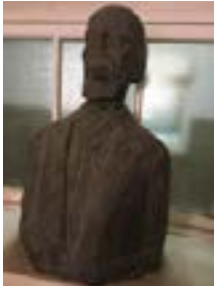
Fig. 9. Statue of Theodore Bilharz in the Department of Medical Parasitology, Faculty of Medicine, Cairo University (Kasr Al Ainy Medical School).

Conflict of Interest: The author declares that there is no conflict of interest with any body.