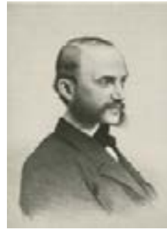
Fig. 2. Professor Griesinger.

Bilharz was so pleased to receive this invitation to go to Egypt to the degree that he was unable to sleep during the night. He began his journey on May 25, 1850,