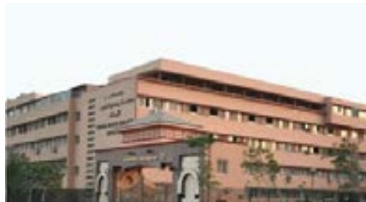
Fig. 10. The Research Institute of Theodor Bilharz in Cairo, Egypt.