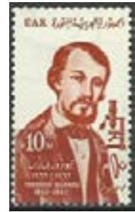
Fig. 11. Postal stamp carrying the photo of Theodor Bilharz produced in 1962.