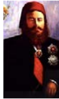
Fig. 5. Said Pasha, the ruler of Egypt after Mohamed Ali.

When Said Pasha (Figure 5), came to rule Egypt, he assigned the supervision of Kasr Al Ainy School of Medicine to the French physician Clot Bey, who invited a French team to assist him. Griesinger had to leave early in 1852 and Bilharz fell in disfavor. However, Clot Bey accepted him as a professor of Anatomy to keep him away from Medicine and Surgery. Bilharz accepted the new job willingly, and continued in teaching Anatomy [6] . Soliman Pasha Elfaransawy (the French General of the Egyptian Army) at the time of Mohamed Ali placed his palace, at the side of the Nile, at the disposal of Bilharz, Reyer and Lautner, where they lived. Bilharz had to replace his professor in serving the Khedive as a private physician. Although he dreamt of escaping from the administrative