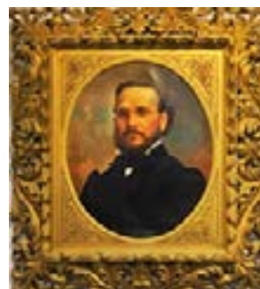
Fig. 1. Picture of Theodor Bilharz in the museum of Faculty of Medicine, Cairo University (Kasr Al Ainy School of Medicine).

Theodor Bilharz studied in the secondary school of Simaringen and finished the Fürstlich Sigmaringer Gymnasium with good marks. Later, he studied philosophy for two years at the Albert-Ludwigs-Universität in Freiburg im Breisgau, where his studies included mathematics, physics, chemistry, mineralogy, botany, geology, archaeology, antique art, history, ethics and psychology [2] . He added to this long list of studies, English and French languages. He was