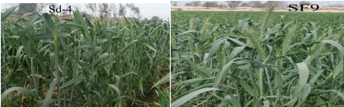
Figure 5. The earliest heading shown by SF9 as compared with the better parent Sids-4