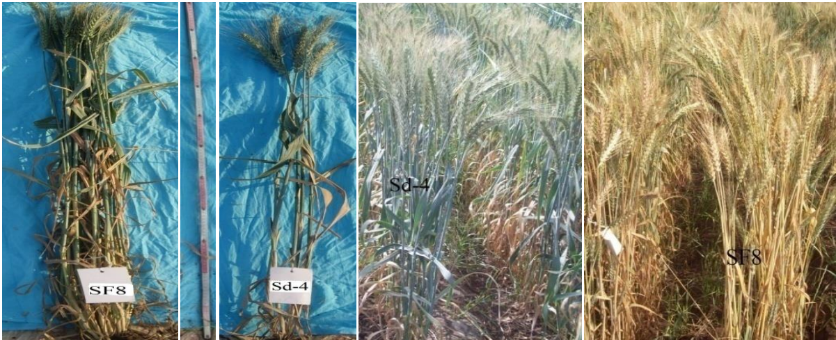
Figure4. The earliest maturity and tallest plant shown by SF8 as compared with the better parent Sids-4