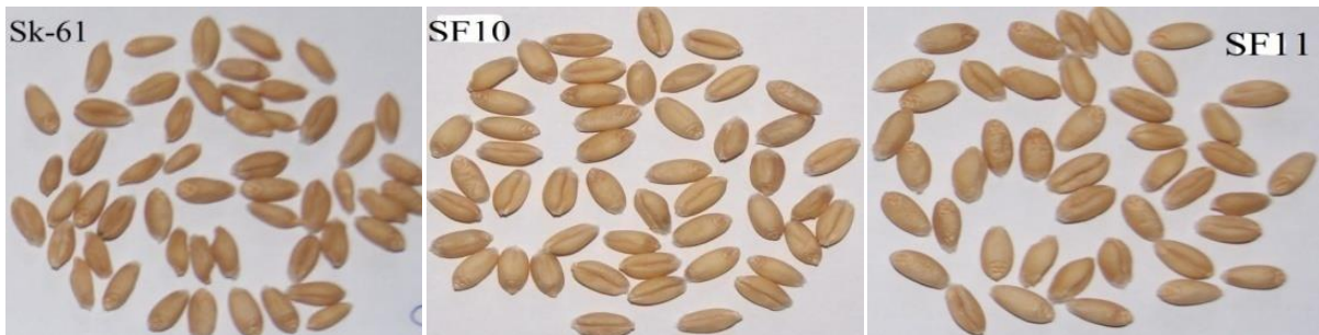
Figure 6. The heaviest grains shown by SF10 and SF11 as compared with the better parent Sakha-61