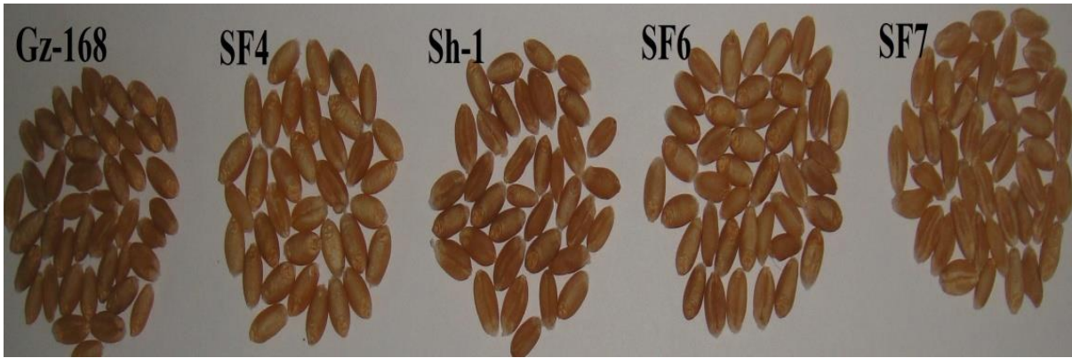
Figure 3. The heaviest grain for SF4 and (SF6 and SF7) as compared with their parents Gz-168 and Sh-1, respectively.