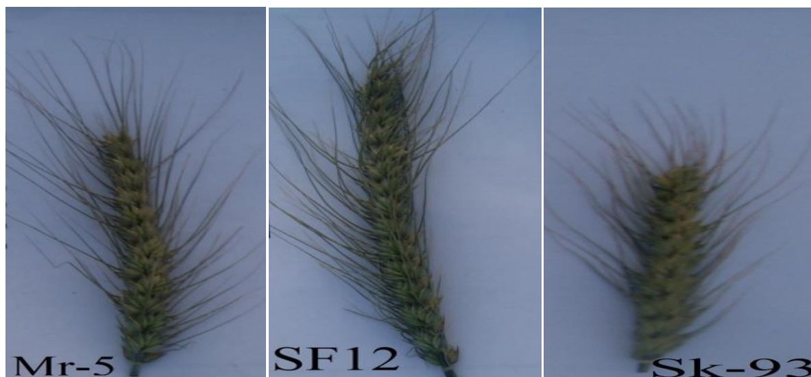
Figure7. The longest and heaviest spike of SF12 as compared with the better parent Maryout-5 and Sakha-93