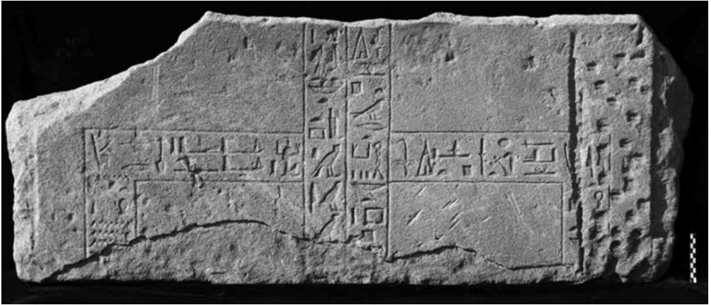
Figure. 9.3 Sandstone lintel F9010 found reused in grave 210 at Amara West, Sudan.

The offering formula itself provides additional evidence for the existence of a cult of Werethekau as it is commonly understood as a ritual (Barta 1968, 267, 270–271; Franke 2003, 39; for the offering formulae of Werethekau, see Ouda 2013, 4–5). Further evidence for a cult of Werethekau at Amara West is provided by a stela showing Ramesses III offering wine to Amun, Bastet-Werethekau, and Horus of Buhen (Fairman 1939, pl. 15; Kitchen 1983, 382 [6]).