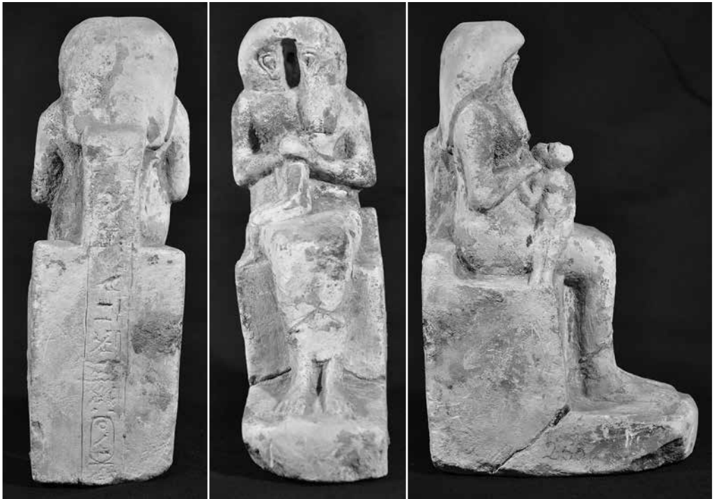
Figure. 9.1 Werethekau suckling a child on her lap (CG 42002).