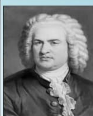
J. Seb. Bach