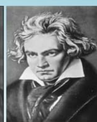
L. v. Beethoven