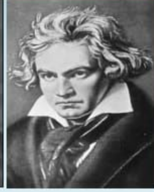
L. v. Beethoven