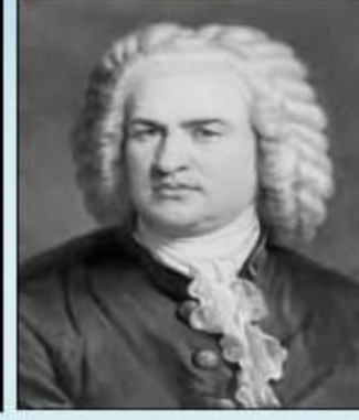
J. Seb. Bach