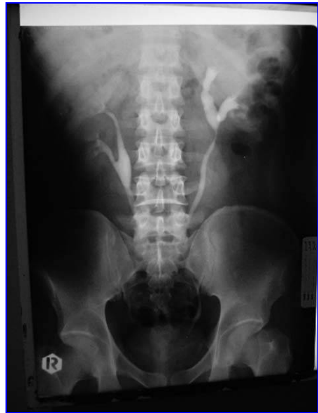
FIG. 2. High-lying kidneys: Lower calyx is above the level of the costal margin.

order, patients with extreme obesity (when the distance between the skin and the kidney was expected to exceed the working length of the nephroscope), and patients with active pulmonary or pleural disease.