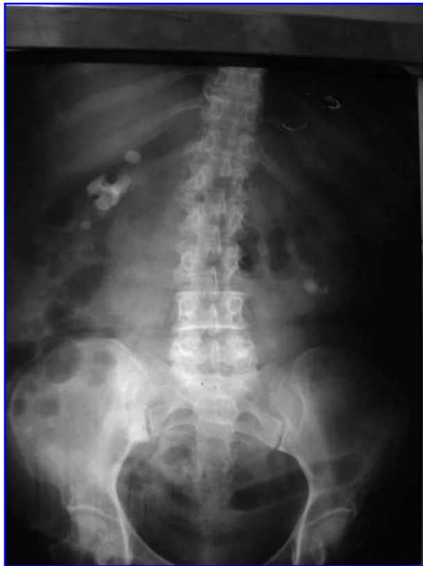
FIG. 1. Radiograph shows large upper caliceal stones.

We excluded from the study patients who were unfit for general anesthesia, patients with an uncontrollable coagulation dis-