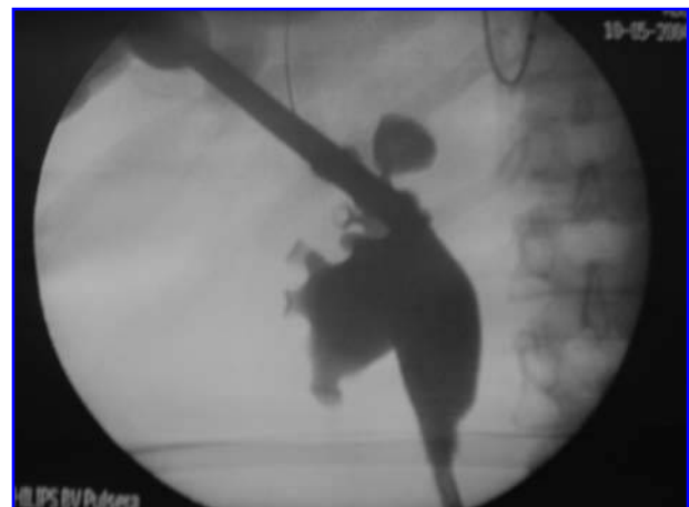
FIG. 4. Post-operative routine nephrostogram.

Intraoperative bleeding occurred in one patient at the end of the percutaneous session. He had multiple stones in his left kidney, which necessitated two punctures for clearance. Bleeding occurred because of injury of the lower caliceal infundibulum during dilatation of the second puncture. This was a complication of the standard and not the supracostal access; the upper calix in most of our procedures did not require any dilation and