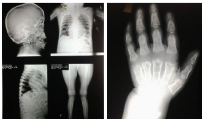
[Table/Fig-1]: (a) Skeletal survey of a five-year-old girl with type VI. Enlarged cranium-J shaped sella turcica-enlarged heart-wide ribs-dorsolumbar gibbus at D12/ L1-anterior breaking of vertebral bodies. (b) The same patient's hand- wide metacarpal, proximal and middle phalanges-pointed proximal ends of the second to fifth phalanges.