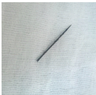
Figure 2: The rusty sewing needle found in the cavity of the right atrium embedded in its wall.

digital palpitation of the right atrium were unsuccessful. A mobile C-arm X-ray machine was brought to the operation room to confirm the position of the needle inside the right atrial cavity. Cardiopulmonary was then initiated via aorto-bicaval cannulation. After snaring of both cavae, the right atrium was opened transversely along the atrio-ventricular groove and astonishingly a rusty sewing needle was found embedded with its sharp end in the roof of the right atrium near the tricuspid valve ( Figure 2 ).