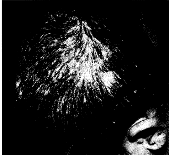
Fig. 7: Scaly ringworm due to Microsporum canis in a boy

infection and 116 endothrix infection of favic type. Cultural examination of „40 Random Cases“ yielded 20 isolates of T. schoenleinii , 16 of T. violaceum 2 T. mentagrophytes and 2 M. canis . The author stated that T. schoenleinii and T. violaceum caused the majority of the tinea capitis infections seen in both rural and urban Egypt. They also reported that although they isolated T. mentagrophytes and M. canis from a few cases only, the latter organism seemed to be rapidly increasing in the larger cities. This would appear to have been borne out this present study carried out 10 years later. TAYLOR and BASSALY (8) reported in 1964 on 400 cases of tinea capitis among Egyptians, of these 162 were due to T. violaceum , 139 M. canis , 19 T. schoenleinii , 30 T. violaceum + M. canis , 1 T. violaceum + T. schoenleinii and 1 due to T. schoenleinii + M. canis . T. violaceum and M. canis (fig. 7 and 8) were predominantly urban and T. schoenleinii rural.