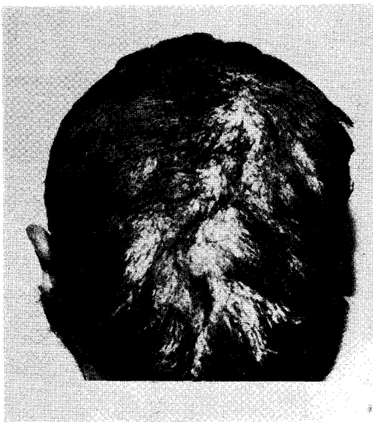
Fig. 3: Scaly favus due to Trichophyton schoenleinii in a boy

or favus (fig. 2 and 3), sometimes the white-headed form. The method used by us is the usual one, the area affected is cleaned at first with 70% alcohol, few hairs are plucked off with previously heated non-toothed forceps and scales are collected by scraping with a sterile blunt scalpel. Some of the material collected are put on a slide in one or two drops of 15% KOH and covered with a coverglass, heated gently and left for 15—20 minutes to be examined microscopically. The remaining portion of the specimen is inoculated on the spot in SABOURAUD-chloramphenicol-cycloheximide agar.