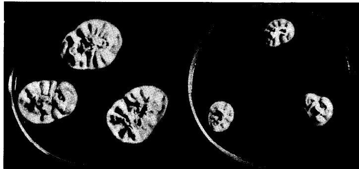
Fig. 5: Trichophyton schoenleinii . Left PETRI dish: Culture on SABOURAUD's glucose agar; right PETRI dish: Culture on SABOURAUD's pepton agar