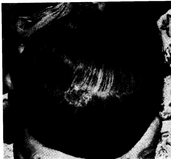
Fig. 6: Black dotted ringworm due to Trichophyton violaceum in a girl 8 years old

The prevalence of T. violaceum as a cause of Tinea capitis (fig. 6) found in this survey is in agreement with the finding of COUTELEN et al (1) in Tunisia, Tripoli, Morocco, Algeria and Egypt. In a clinical laboratory study of tinea capitis in Egypt GALLOWAY et al (2) found that by direct examination of 300 consecutive cases, 184 showed endothrix