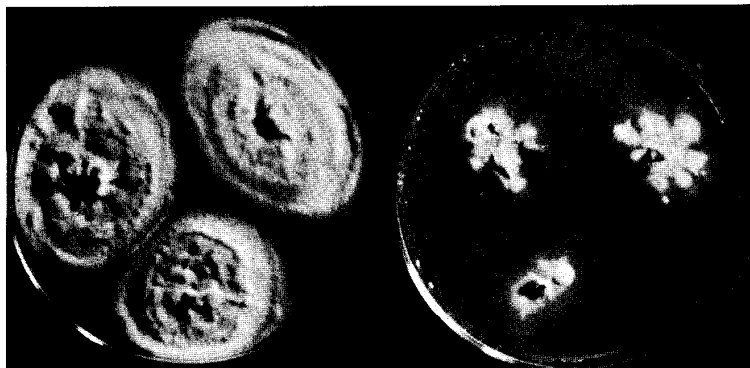
Fig. 8: Microsporum canis . Left PETRI dish: Culture on SABOURAUD's glucose agar; right PETRI dish: Culture on SABOURAUD's pepton agar

infection and 116 endothrix infection of favic type. Cultural examination of „40 Random Cases“ yielded 20 isolates of T. schoenleinii , 16 of T. violaceum 2 T. mentagrophytes and 2 M. canis . The author stated that T. schoenleinii and T. violaceum caused the majority of the tinea capitis infections seen in both rural and urban Egypt. They also reported that although they isolated T. mentagrophytes and M. canis from a few cases only, the latter organism seemed to be rapidly increasing in the larger cities. This would appear to have been borne out this present study carried out 10 years later. TAYLOR and BASSALY (8) reported in 1964 on 400 cases of tinea capitis among Egyptians, of these 162 were due to T. violaceum , 139 M. canis , 19 T. schoenleinii , 30 T. violaceum + M. canis , 1 T. violaceum + T. schoenleinii and 1 due to T. schoenleinii + M. canis . T. violaceum and M. canis (fig. 7 and 8) were predominantly urban and T. schoenleinii rural.