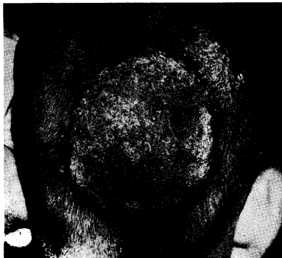
Fig. 1: Black dotted tinea capitis due to Trichophyton violaceum in a boy 10 years old

In the last two years we examined 250 cases referred to the mycology laboratory with the clinical diagnosis of either tinea capitis, especially the black dotted form ( fig. 1 ),