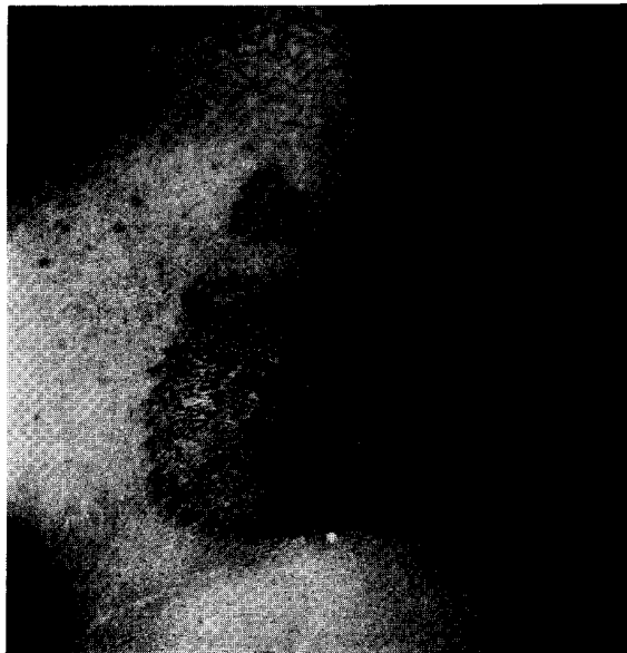
Fig. 1: Extensive tinea cruris with the characteristic edge

The dermatophyte was isolated from 17 tinea cruris and 7 tinea corporis cases. The lesions were progressive and tended to involve extensive areas of skin. The edge of the lesions was characteristically elevated, cord-like and covered with minute vesicles and crusted papules 0.5—1 mm in diameter; the center was brownish and scaly (Fig. 1). Sometimes several small