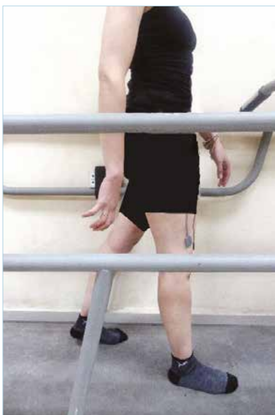
Figure 4. Walking trial

forward walking. The percentage of increase of the vastus medialis obliquus muscle normalised root mean square mean value was 100.36% during backward walking versus forward walking. Additionally, the percentage of increase of the normalised electromyography activity of the vastus lateralis muscle during backward walking was 50.27%. The normalised root mean square mean value of gluteus medius muscle increased during backward walking by 27.89% versus forward walking, as shown in Table 2 .