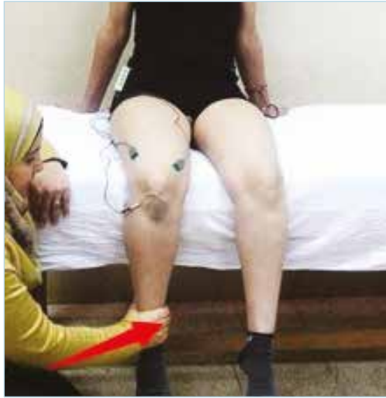
Figure 1. Recording the maximum voluntary isometric contraction of the vastus medialis obliquus and vastus lateralis muscles