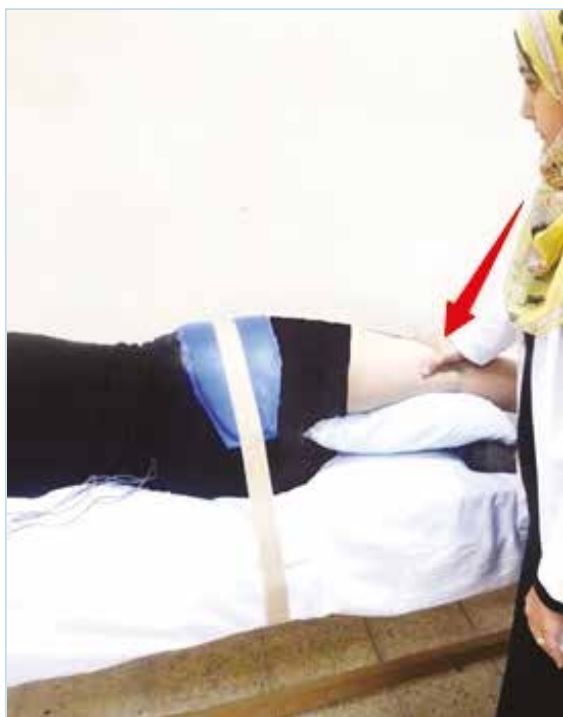
Figure 3. Recording the maximum voluntary isometric contraction of the gluteus medius muscle