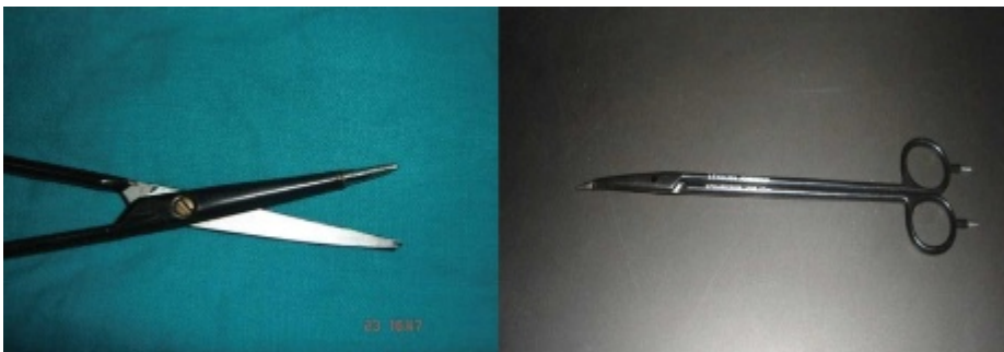
Figure 1. PowerStar bipolar scissors.

The technique is shown in Figure 2. Patients were orotracheally intubated and placed in the supine position. A Boyle-Davis gag was inserted and supported by Draffin Bi pods (Bolton Surgical, Sheffield, UK). The tonsil was grasped and rolled medially with the tonsillar grasping forceps. Dissection started at the medial edge of the anterior faucial pillar with a slow cutting movement and simultaneous current application. The bulge of the tonsil was then identified, and care was taken to stay close within the capsular plane. Occasional blood vessels seen during the dissection were coagulated between the blades of the bipolar scissors by applying current just before cutting. The dissection was then carried out toward the lower pole