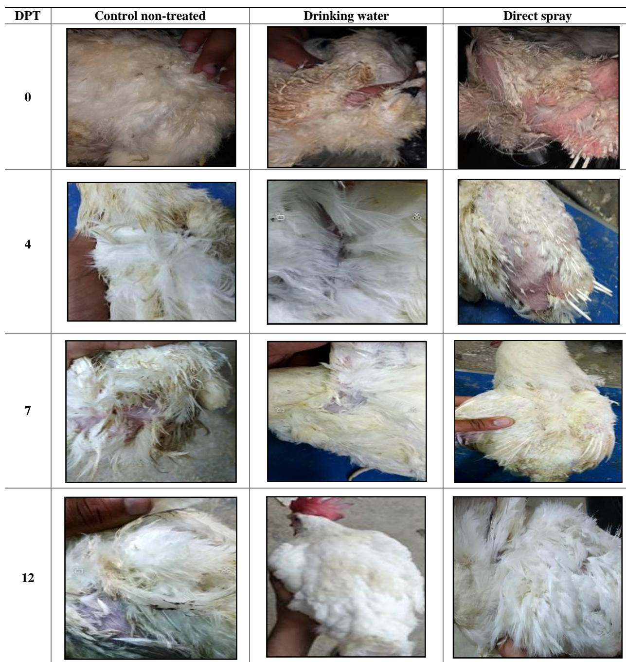
Figure 2. Effect of Allisal essential oil at 0.25% concentration in drinking water and water direct spray in red mites natural infested laying hens. DPT: Day post treatment. 0: Time before start treatment. 4-, 7- and 12- Days post- treatment