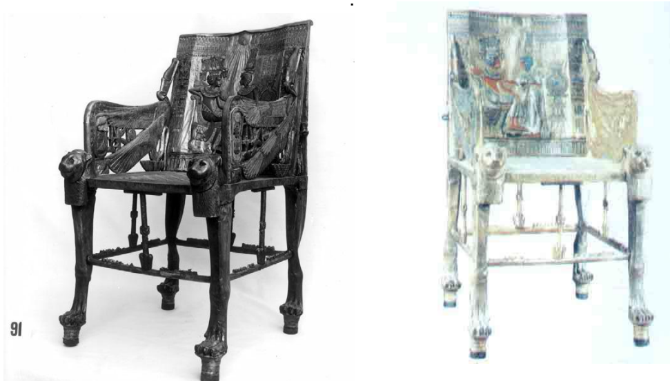
Golden throne, tomb of Tutankhamun (1336–1327 BC). The chair is almost completely covered with thick gold sheet. The seat, a flat board of wood covered in gold, is decorated with over 2000 squares of gold, calcite and faience.