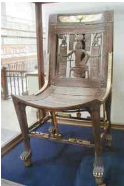
Chair, tomb of Tutankhamun, Egyptian Museum