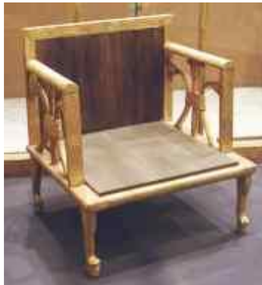
Reconstructed armchair of Queen Hetepheres Cairo Museum