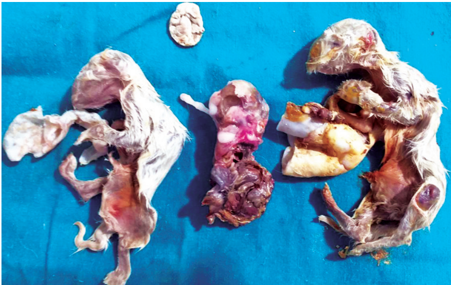
Figure 2. Four ectopic fetuses at different stages of development were identified after opening the gestational sacs and removal of the omentum.