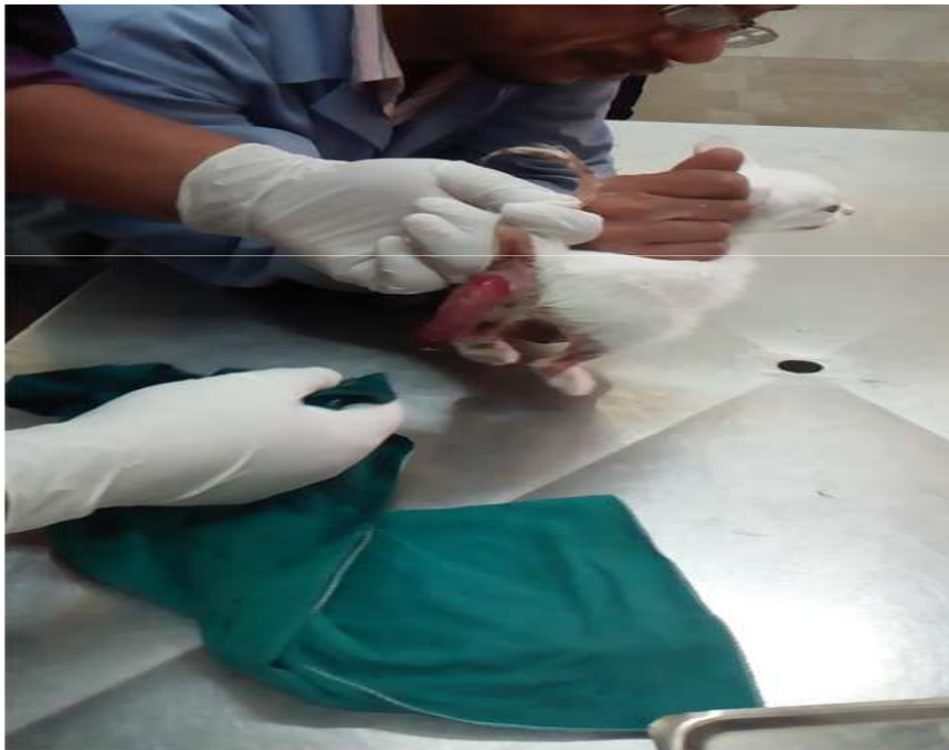
1- Hot fomentation. 2- Anaesthesia by ketamine