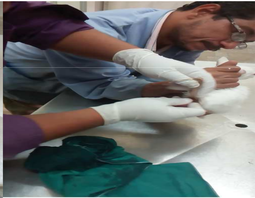
reduction of prolapsed tissue into anal opening