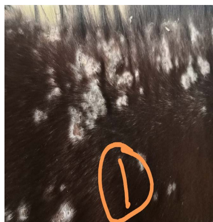
Figure 1: Showed area of alopecia with scales and skin thickening on mane, head and around the eye.

Summer eczema is a disease of seasonal recurrence characterized by allergic dermatitis caused by culicoid bites (Oliveira-Filho et al., 2012). Clinical signs of horse summer eczema are depicted in Figures (1-4). The most common clinical signs are seen in the head, mane, tail, and dorsal mid-line. These lesions are characterized by intense pruritus which results in rubbing and alopecia, skin damage, thickening, and scale formation. These signs were described in previous studies (Björnsdóttir et al., 2006).