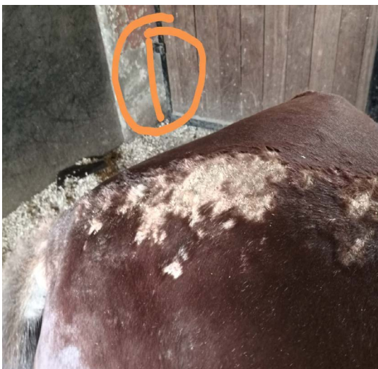
Figure 4: Showed alopecia, scales and skin thickening on mane, dorsal midline and tail.

Table 1 shows the hematological alterations. Significant increase in eosinophils but no increase in neutrophilia recorded in patients when compared with control data. A hypersensitivity reaction triggered by Culicoides bites causes pruritus and activates an immune response, leading to elevated eosinophils in circulation (Long et al., 2016). This finding was on par with Ono et al. (2021) who found an increase in eosinophil levels in the summer, which is associated with allergic skin dermatitis caused by Culicoides hypersensitivity. Similar findings were recorded in other skin affections and parasites. For instance, in sheep-infested lice, Tadie et al. (2018) recorded an increase in the numbers of eosinophils due to allergic reactions caused by irritation of lice infestation.