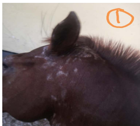
Figure 2: Showed area of alopecia with scales and skin thickening on mane, head and around the eye.