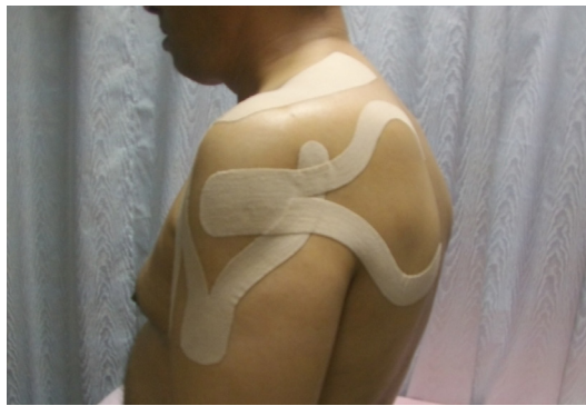
Figure 2: kinesiotaping application

After informed consent and base line assessment, patients were assigned by a random-number generator to one of two intervention groups through concealed allocation : Astym therapy group (n=28) and Kinesiotaping group (n=28) fig 3. Patients were asked to decline any additional form of treatment for their shoulder during the course of the study .Also they were instructed to maintain current levels of medication and not to begin any new medications. All participants received conventional physical therapy program for shoulder pain, that include: hot packs for 20 mint/session and exercises in the form of strengthening exercises for the trapezius, serratus anterior and shoulder external rotation in addition to stretching for pectoralis muscles two times a week for 12 weeks.