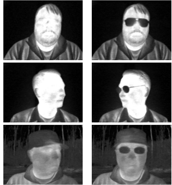
Figure 3. Samples of Terravic Facial IR Database.

Scenario THREE: It was designed to investigate the accuracy rate of our face identification approach when changing of the ensemble size (i.e. L ) of RLO. This scenario is further divided into two sub-scenarios: one to change the value of L while keeping the size of the database equal to 17 classes and the SFTA's threshold ( n_t = 1 ) and the second to also change the value of L while keeping the size of the database equal to 17 classes and the SFTA's threshold ( n_t = 3 ). Each of these sub-scenarios was evaluated in the case of PCA and LDA variants of our approach. Table (III) summarizes the experimental results of these sub-scenarios.