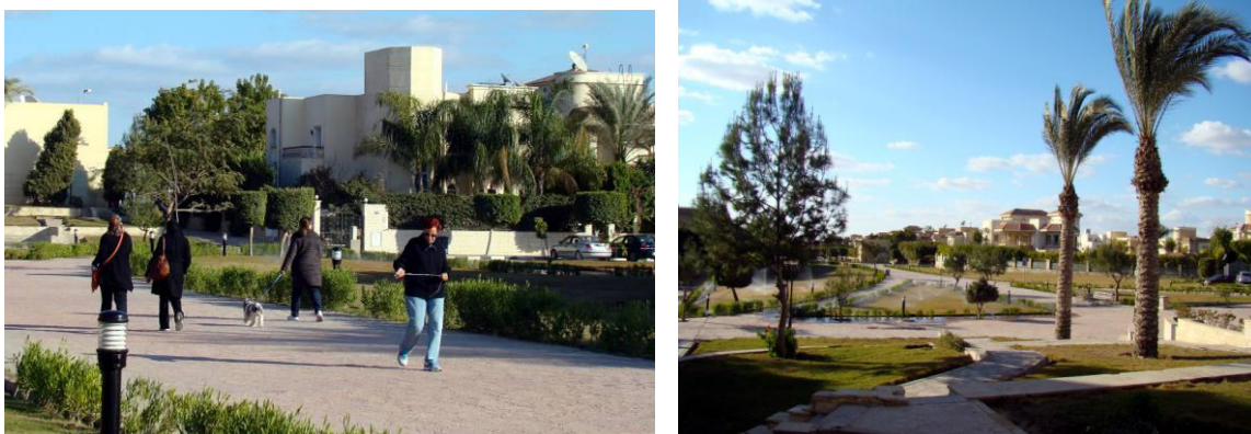
Fig. 5. (a) Uses of open spaces at Beverly Hills;. (b) Well maintained open space yet without place-making

Finally, the issue of place-making is very controversial in Beverly Hills like the other gated communities in Cairo. The public spaces are well designed and maintained, due to the efforts of the owning company who initiated a policy of obligatory maintenance fees. However, the spaces host very few activities, which are to some extent individual as presented by the residents. The activities range from jogging, dogs' walk, playing of children, but in the absence of strong economic or cultural forces, these activities are very limited, see Fig. 5. Recently, efforts are exerted by the owning company to host sports events and cultural and religious activities to increase the sense of place and thus the sense of belonging to the compound.