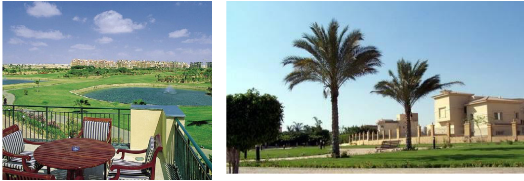
Fig. 1. (a) View from an apartment at Dreamland in 6 th of October; (b) Luxurious gated compounds at the periphery's of Cairo