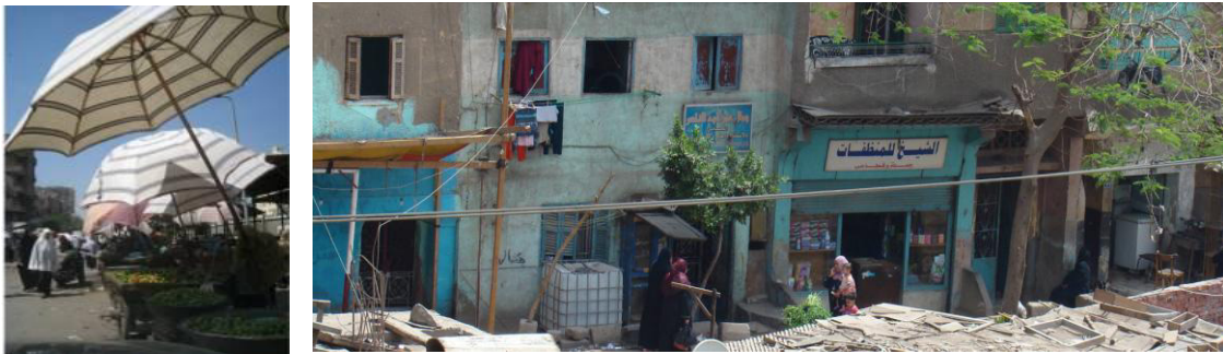
Fig. 8. (a) Local temporary market held in the public space. (b) The street used as an extension for shops and cafes

The economic base of the whole district is weak, depending on temporary works and to a great sum of the families the woman is the household financier. However, the open spaces provide an excellent accommodator to locally based economic activities, for instance the market, the exhibitions of the workshops, the coffee shops, all utilize any left-over space to accommodate any activity no matter how small, see Fig.8.