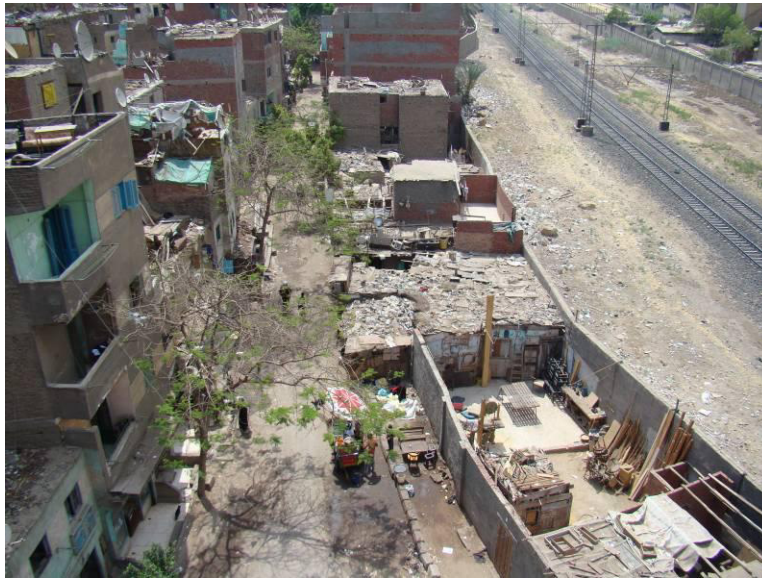
Fig. 7. Spread of garbage all over the district

The economic base of the whole district is weak, depending on temporary works and to a great sum of the families the woman is the household financier. However, the open spaces provide an excellent accommodator to locally based economic activities, for instance the market, the exhibitions of the workshops, the coffee shops, all utilize any left-over space to accommodate any activity no matter how small, see Fig.8.