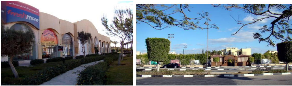
Fig. 4. (a)The local market; (b) Clubhouse at Beverly Hills with limited users (Source: Author, 2012)

As to the politics of public space in the compound, this aspect appeared to be very weak in the course of the study. The public spaces are used for leisure and as aesthetic places, but no calls were arranged even during the time of the revolution due the sole role of the district which is the residence. However, the field survey revealed a strong role for the central mosque during the time of the elections in supporting the Islamic political parties, yet, this was done through sub-activities, such as the web social interaction sites.