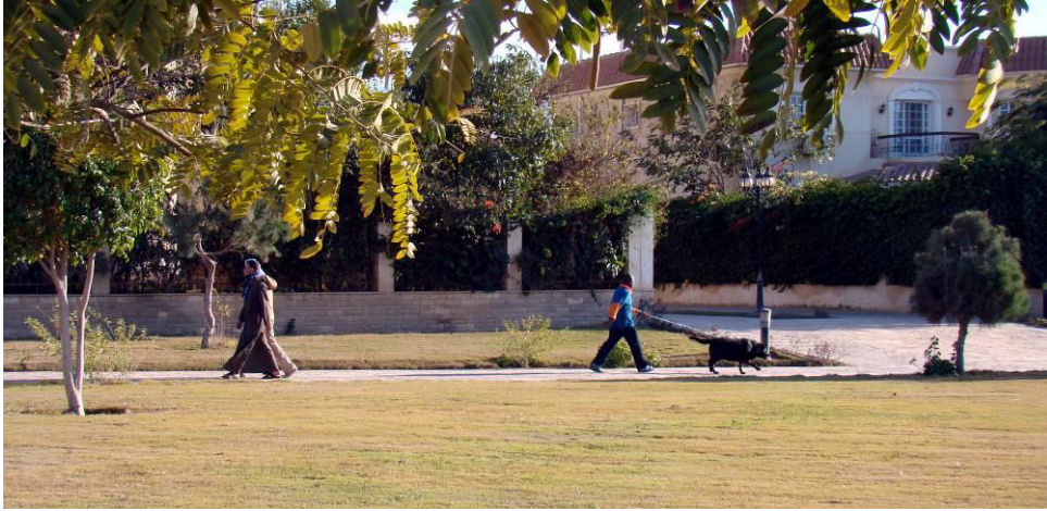
Fig. 3. The paradox between the user's of the public space in Beverly Hills, either elite residents or guards (Source: Author, 2012).

will increase not decrease the social injustice which the revolution was standing against, with new generations who never walked in the streets of downtown, see Fig. 3.