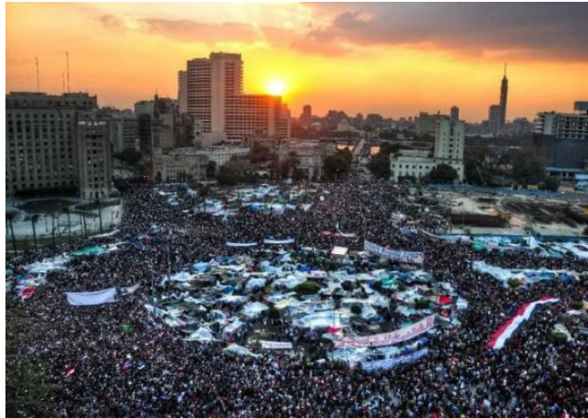
Fig. 2. Tahrir Square during the early days of the revolution witnessing the gathering of hundreds of thousands of Egyptians