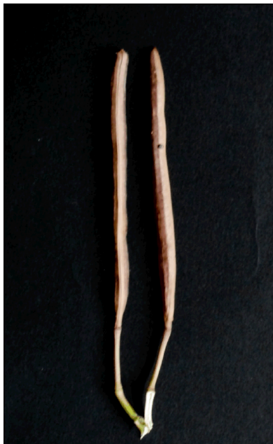
Fig. 7: A photograph showing mature pod of S. Sophera