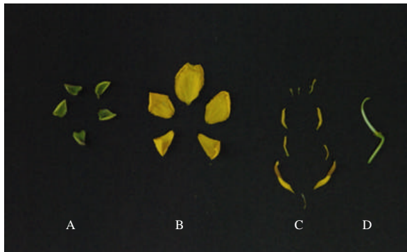
Fig. 6: A photograph showing the floral whorls of S. sophera A, sepals; B, petals; C, stamens; D, carpel