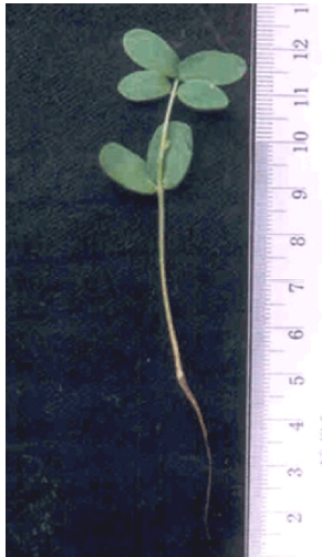
Fig. 1: A photograph of S. sophora seedling, two weeks old, showing its epigeal pattern of growth where the two cotyledons are brought above the soil. The first foliage leaf is developed; it is paripinnately compound with two pairs of ovate leaflets

tapered towards its apex. Lateral roots develop acropetally towards the apex and extends horizontally in the soil. At advanced stages of growth, the root system is completely developed, mainly composed of a stout tap root developing a few number of lateral roots, strongly established in a semi-horizontal position.