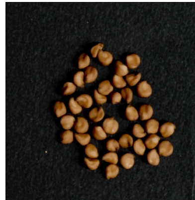
Fig. 8: A photograph showing mature seeds of of S. sophera