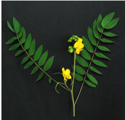
Fig. 5: A photograph showing the paripinnately compound leaves and the inflorescence of S. sophera