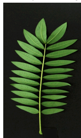
Fig. 3: A photograph represents a well developed paripinnately compound leaf of S. sophera ; the leaf comprised 11 pairs of lanceolate leaflets