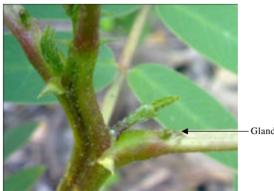
Fig. 4: A photograph showing a large sessile clavate purplish gland on the upper surface of the petiole near its base