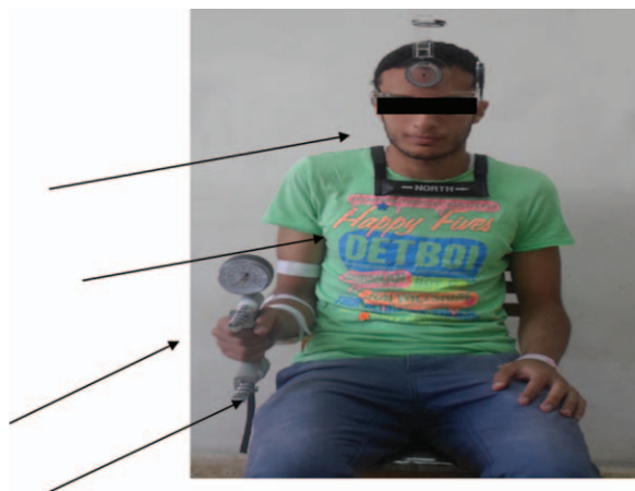
Position of subject and handheld dynamometer with CROM. (a) Cervical range of motion device. (b) Magnet belt with its magnet bar for the compass adjustment. (c) HDD, handheld dynamometer. (D) Wooden right angle device to keep right angle of the elbow joint during all tests.

One trial was conducted in each position [24], with a rest period of 1 min in between to minimize fatigue [25]; the length of contraction was maintained for 3 s [14]. The examiner arranged the order of neck position randomly to minimize the effect of fatigue by using the roll dice.