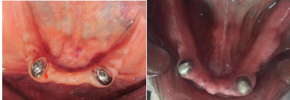
Figure (5) abutment with coping and attachment. Figure (6) abutment with coping