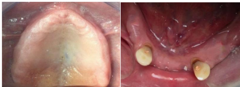
Figure (1,2) upper and lower arch

The upper and lower dentures and the area of biting of the film holder were painted with separating medium. Transparent Self-cure acrylic resin in the dough stage was added on the film holder and the patient was asked to bite on it with denture till complete setting of the acrylic resin. This step was made to put the film holder each time in the same place by the indentations of the denture teeth. Patients were evaluated radiographically to measure bone height end changes around the abutment teeth. The Digora computerized system, the Periapical parallel film holder and a specially constructed acrylic template were used for taking standardized and reproducible serial digital images using the long cone parallel technique. The film holder and the template ensure the position of the film to the abutment teeth as well as a fixed distance from the cone to the film in all the follow-up sessions. The distance were measured from the line perpendicular to the long axes of the tooth at the apex on both mesial and distal sides. This reading was used as the reference point for all the other follow up measurements after 3 and 6 months.