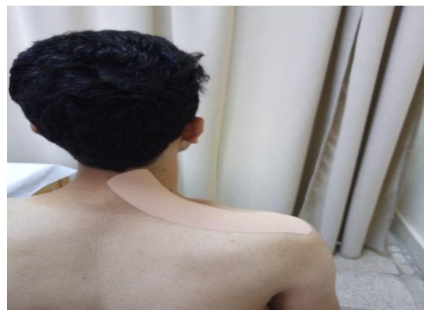
Figure 3: KT application

The subject was seated in a comfortable position. Then, the taped area was exposed, shaved and cleaned with alcohol. The measurement of the tape began from the origin of the muscle at the middle of the acromion to the insertion at the hairline on the nape of the neck. In the resting state, the base of KT was taped at the insertion site at the acromion. Then, the upper trapezius was stretched by applying side bending to the opposite side and rotation to the same side with slight flexion. KT was taped with 10% tension over the belly of the muscle to the point of origin. The tape was rubbed in the elongated muscle position [24] (figure 3).