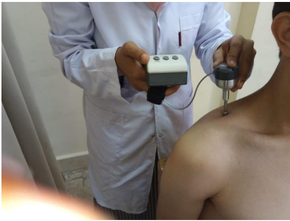
Figure 2: PPT assessment.